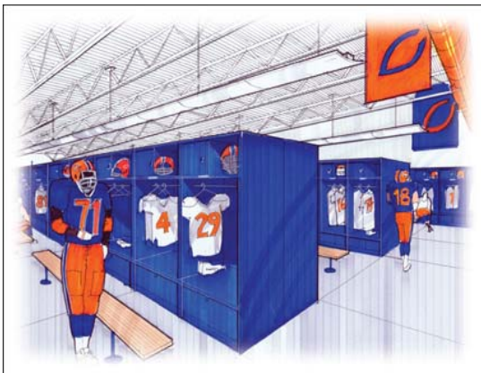
New Locker room facility

Coaches, here is your opportunity to take your team on a retreat and not lose valuable practice time in the process. On the Carroll University Campus you will have access to some of the best training facilities the Waukesha / Milwaukee area can provide. Your team will practice on a synthetic artificial turf field, have access to locker rooms, conduct meetings in our classrooms, and weight train in our strength room. By staying on campus you will not only have opportunity to train and practice but you will also have valuable team building time. Our staff will be available to assist you in any way to compliment your workout time with team building activities.